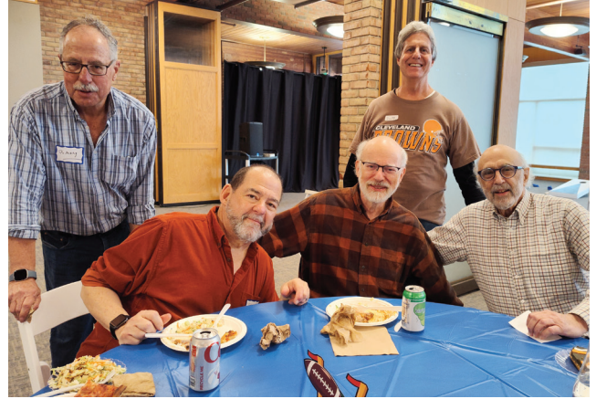
On November 17, our Brotherhood of Mishkan Or welcomed around 100 Mishkan Or members to a Browns Watch party that was great fun, even though the Browns lost.