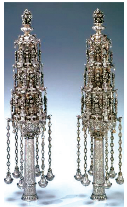
Torah Finials, early 1700s