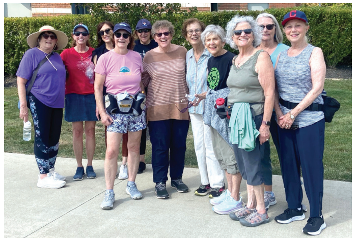
Our Women of Mishkan Or finishing another great hike together! Join them on Tuesday, October 22 for the final hike of the season.

Need to do some Shopping? On Thursday, December 5, if you shop at Knuth's in Pepper Pike, 15% of the proceeds from your sale will be donated back to the Women of Mishkan Or! Let them know you're there to support the Women of Mishkan Or!