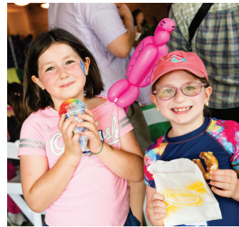
Families having fun at our August Garden Party.